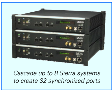
Cascade up to 8 Sierra systems to create 32 synchronized ports